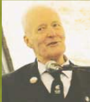
TONY BENN elder statesman, veteran campaigner. "The future's made by people, not by leaders".