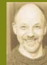
NICK TOCZEK compere and poet